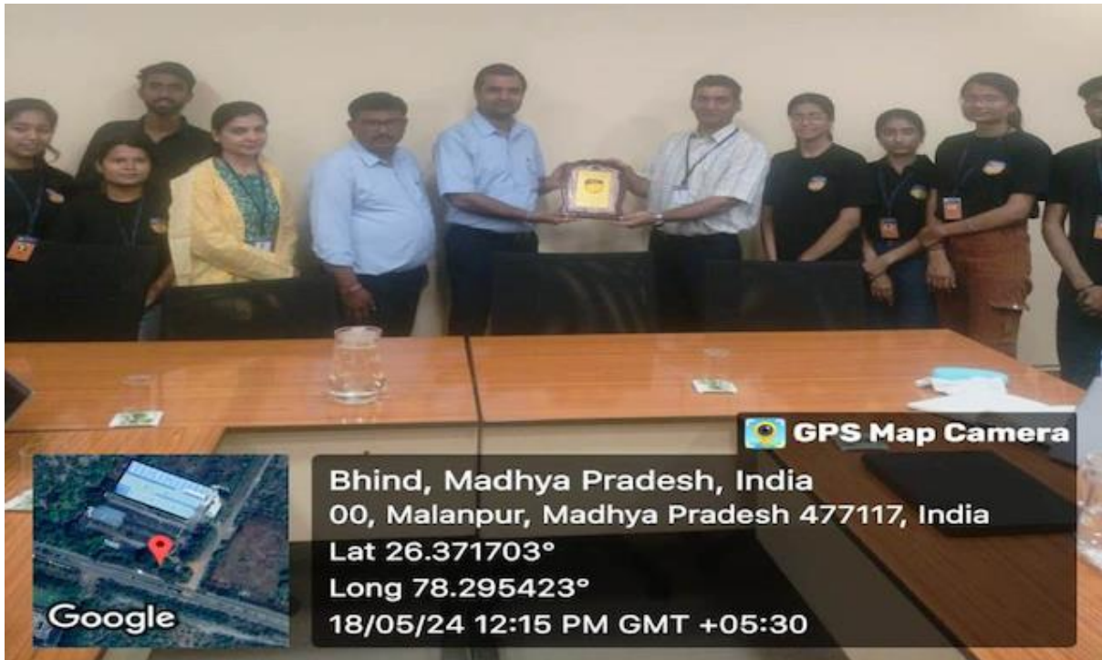
Outreach Activity by the students to make the industry persons aware about the judicious use of water