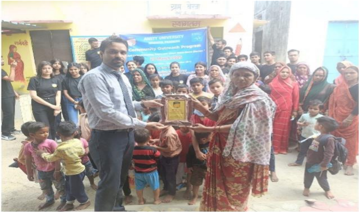
Community Outreach Program “Ami Care: Promoting Awareness About Water Borne Diseases” Held in Gram-Berja, Gwalior